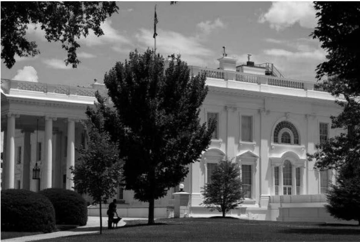
The White House in Washington.