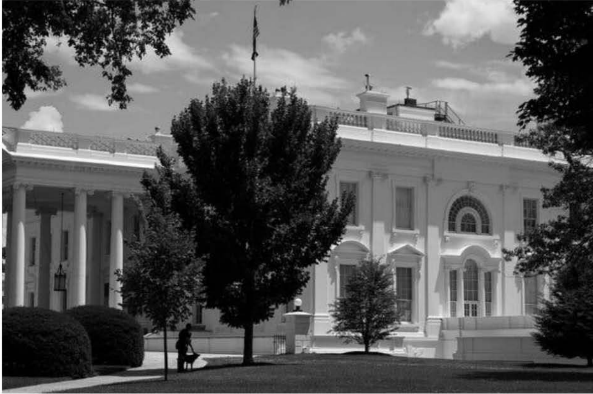
The White House in Washington.